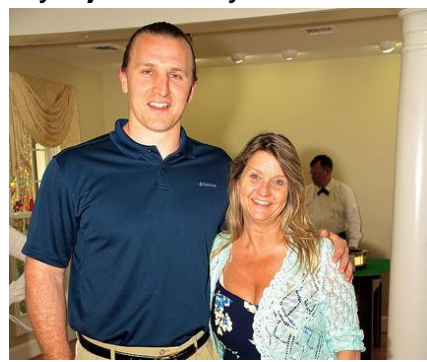
SPECIAL THANKS TO ALL OUR AMAZING SPONSORS!

A good time was had by all!! The event raised approximately $5200 and it will be put towards continual enhancement of the Special Olympics program in Loudoun County. We wish to thank everyone who contributed their time, donations, or gambling expertise to this fun, community building event!! We hope to see many of you join us next year as well.